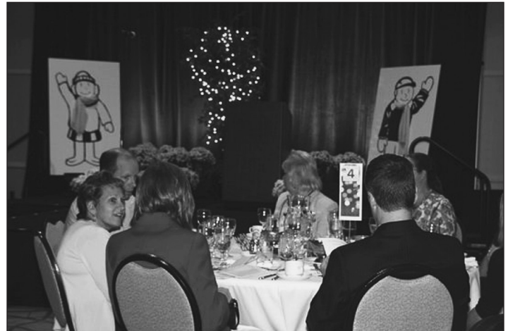
Representatives from Martin's Super Markets enjoy dinner before receiving the Heart of a Child award.