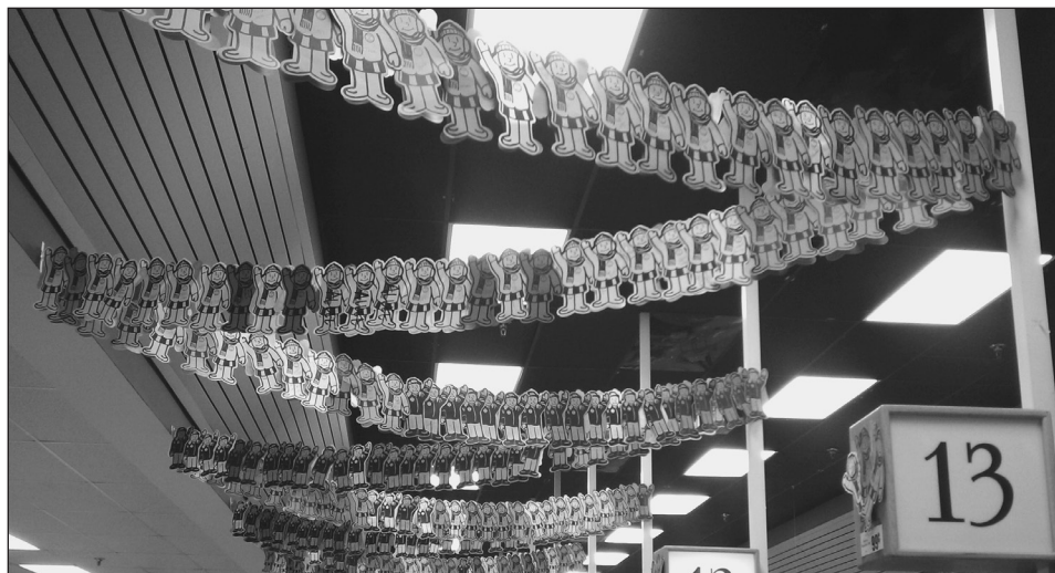
Clothe A Child dolls are arranged for a colorful display at Martin's SuperMarkets. Martin's has partnered with Christ Child on this fundraiser for the last 18 years.