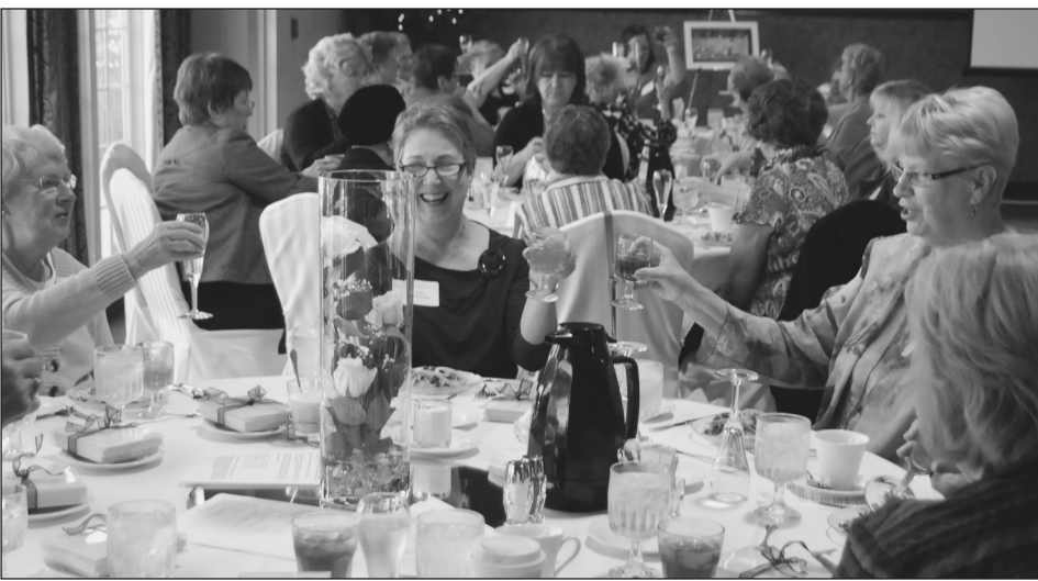
A toast fo Christ Child's 125th birthday