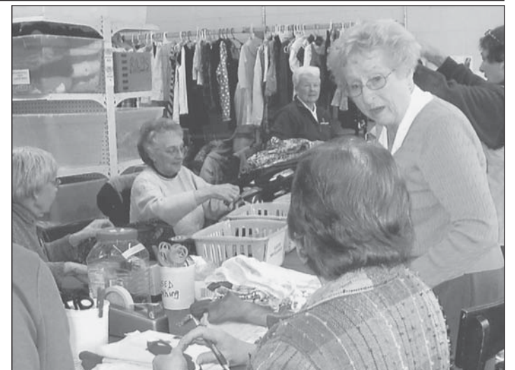
"Many hands make light work" may be a cliché but it's certainly a truism as the women in the used clothing room spend their Wednesday mornings sorting, sizing and putting clothing into bins - all to be ready for clients in August.