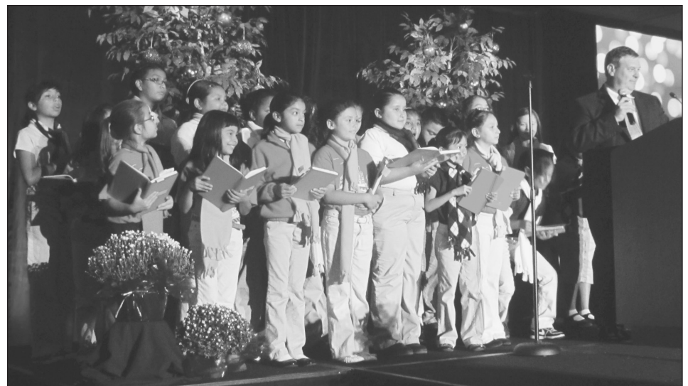
Students from St. Adalbert's children's choir entertained at the dinner.

Oct. 25 ..... Fall Luncheon Windsor Park 11:30 AM