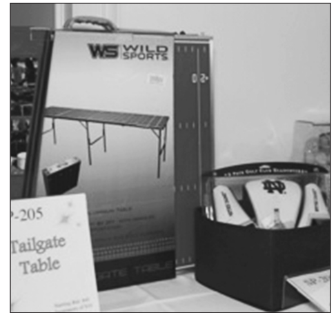
Silent Auction items