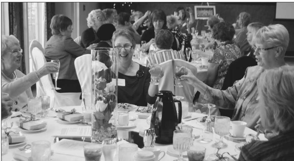
A toast to Christ Child's 125th birthday