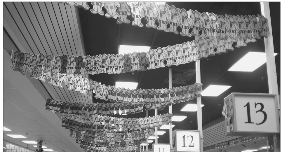
Clothe-A-Child dolls are arranged for a colorful display at Martin's Super Markets. Martin's has partnered with Christ Child on this fundraiser for the last 18 years.