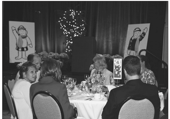
Representatives from Martin's Super Markets enjoy dinner before receiving the Heart of a Child award.